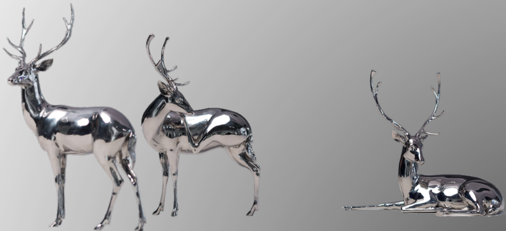
Three Deers 27 x 20 x 9cm / 22 x 28 x 9cm / 23 x 12 x 20cm Stainless Steel