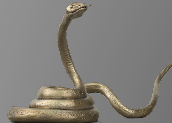
Chinese Zodiac 35cm White Cooper