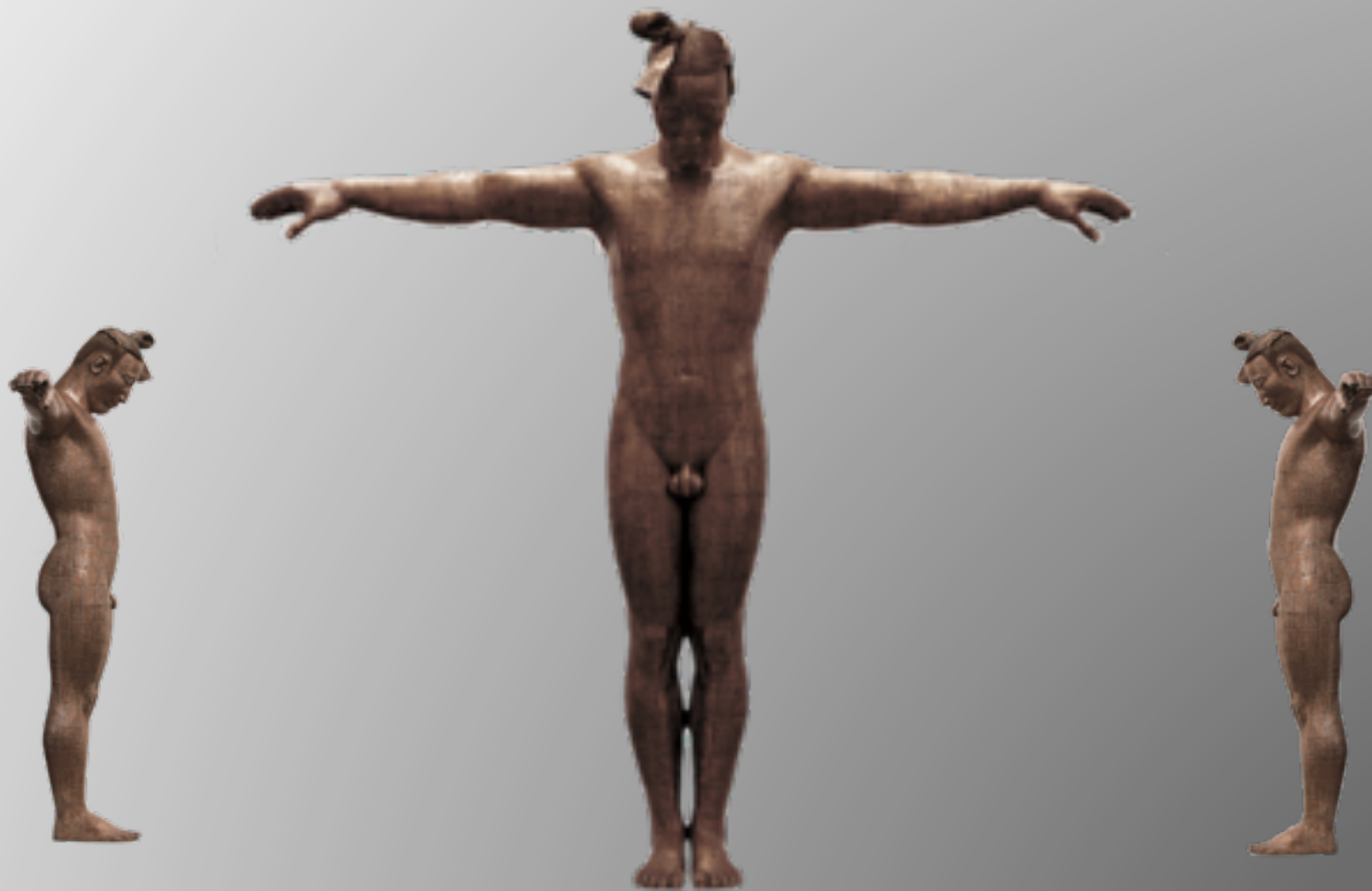
Ode to motherland no.7 120 x 118 x 30cm / 63 x 60 x 15cm Resin / Bronze