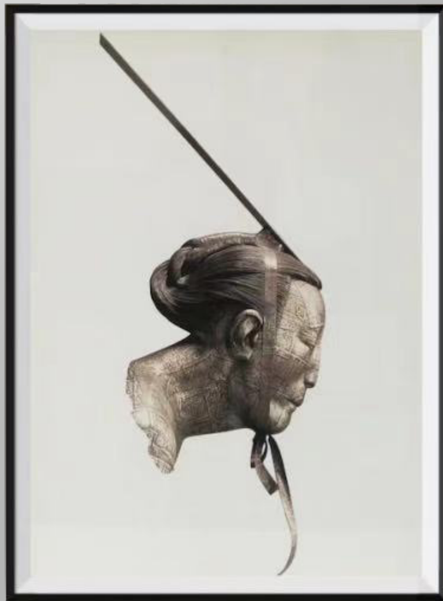
An Attendant 106 x 70cm Silk Screen Print