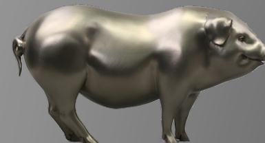
Chinese Zodiac 35cm White Cooper