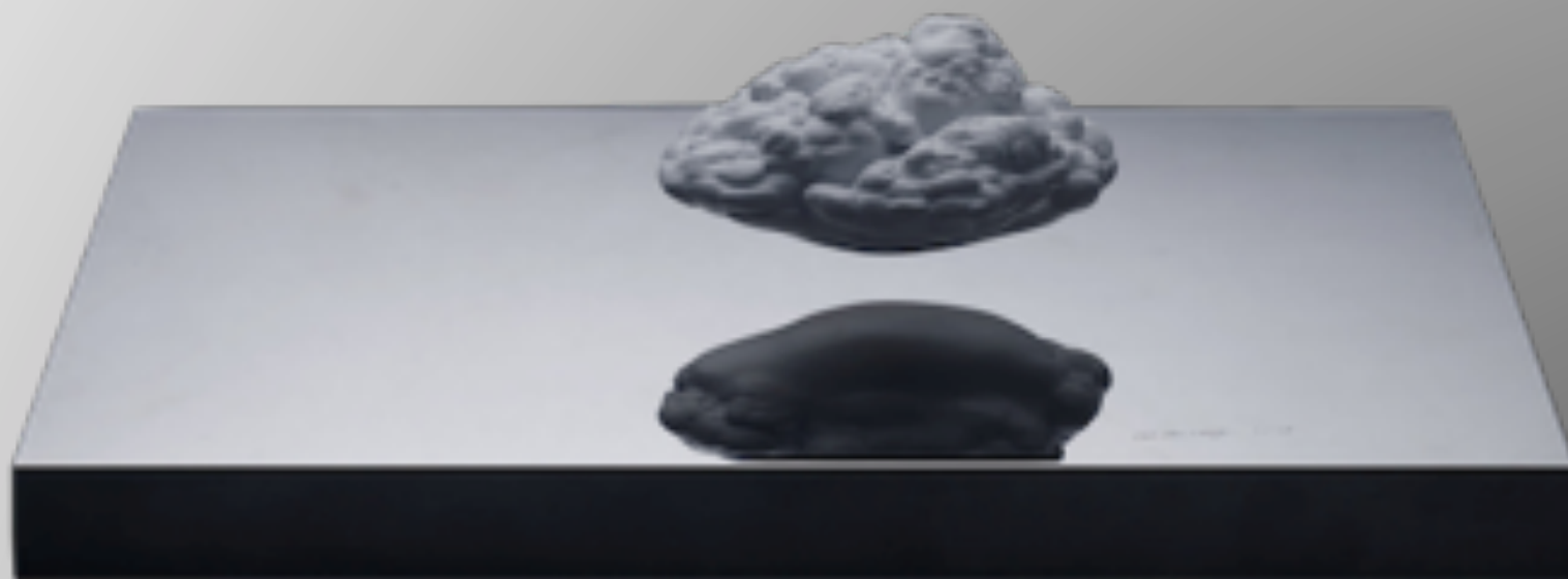
Platform Cloud (Maglev) 38 x 25 x 3cm Mixed media & Stainless Steel