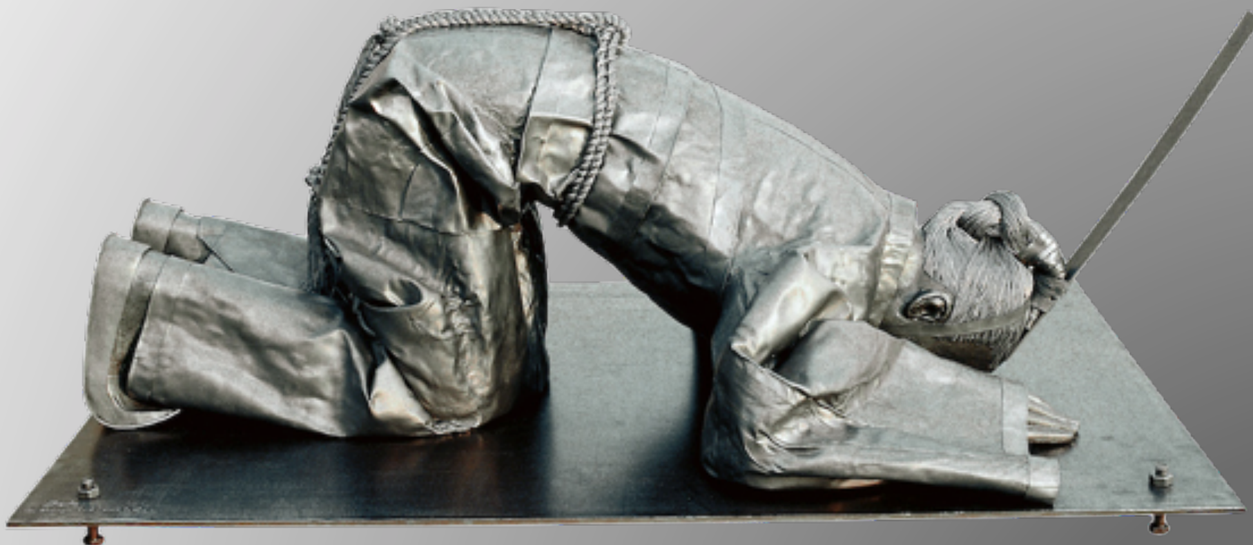
Custom to Motherland no.2 121 x 75 x 45cm Lead