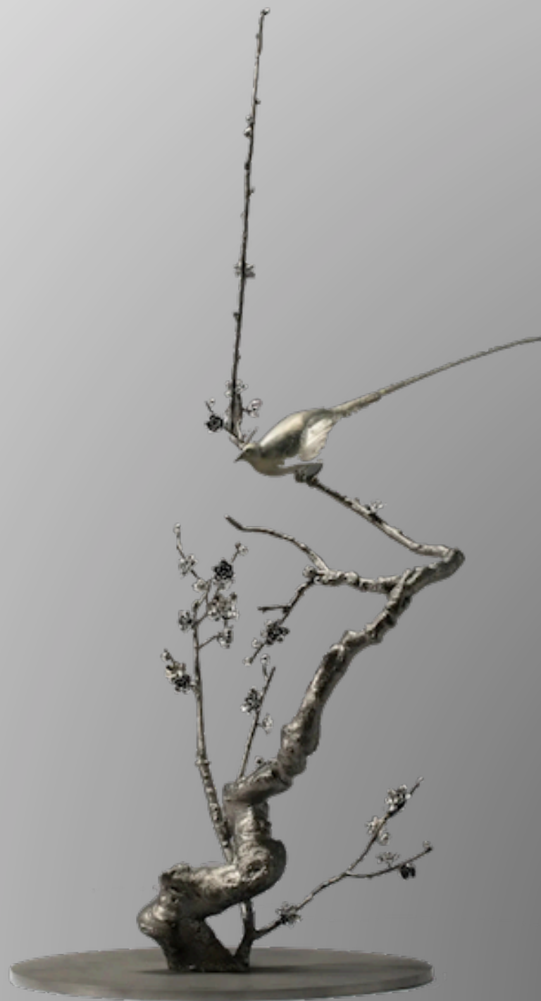
Magpie 81 x 44 x 35cm Stainless Steel