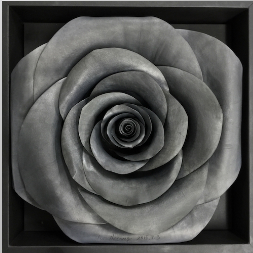
Rose 40 x 40cm Sheet Lead