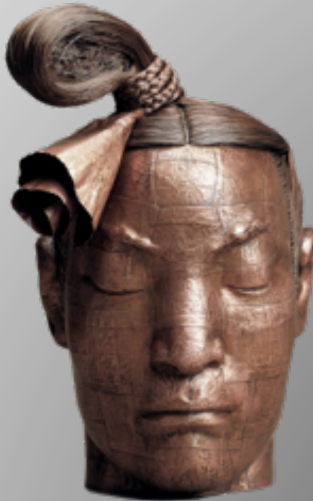
A Warrior no.4 (Head)