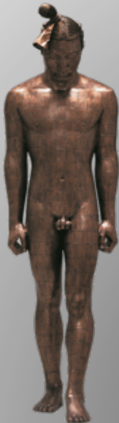
Ode to motherland no.9 189 x 70 x 69cm Glass fiber reinforced resin, copperplate, brass wires