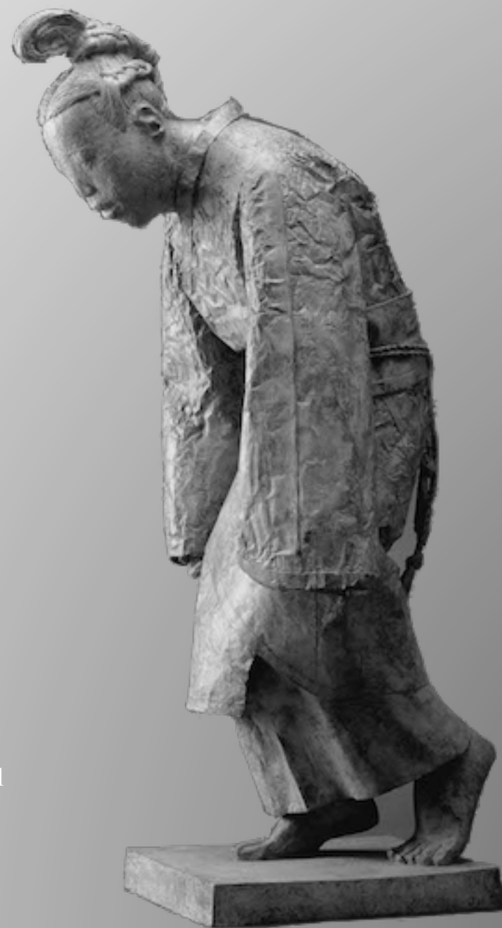
Ode to motherland no.1 52 x 19 x 16cm Bronze