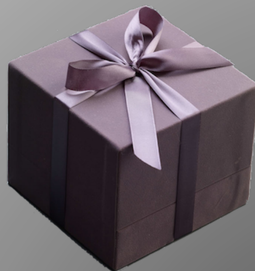
Rose Box 15 x 15 x 12cm Sheet Lead