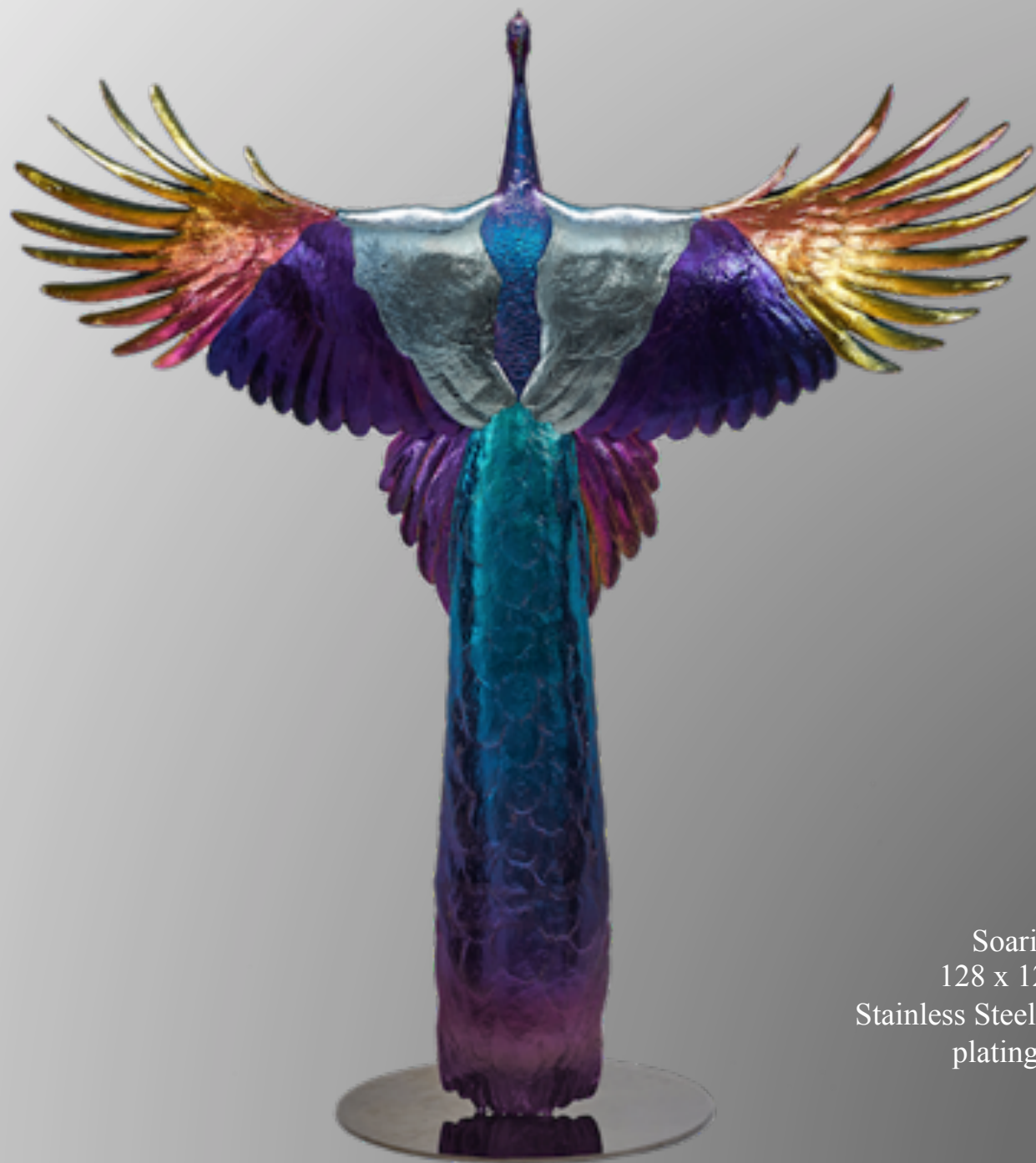
Soaring no.1 128 x 121 x 28cm Stainless Steel & colored nano- plating titanium