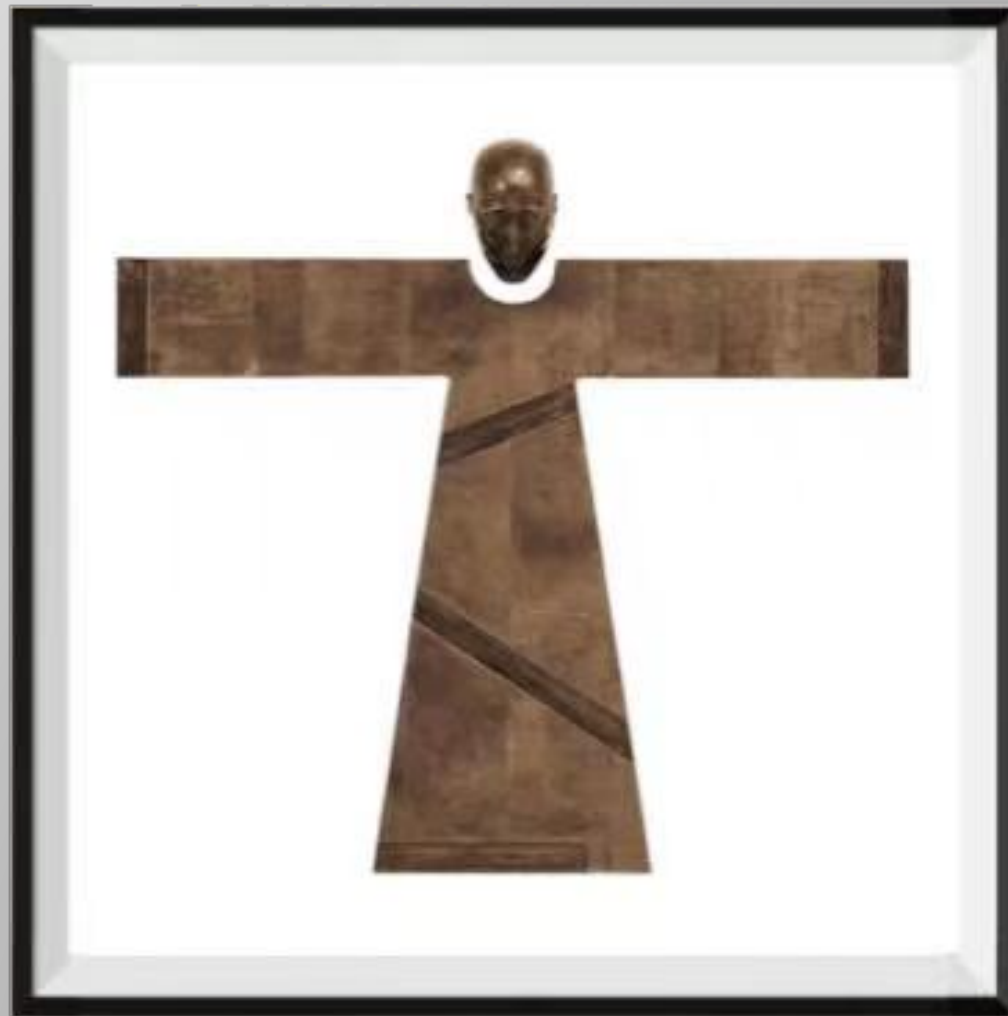
Ode to motherland no.3 106 x 70cm Silk Screen Print