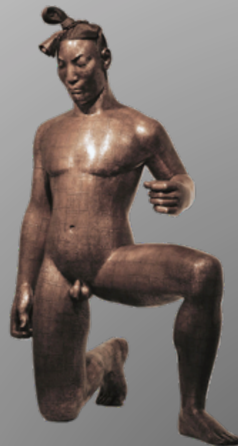
Ode to motherland no.10 50 x 33 x 28cm / 91 x 48 x 63cm Resin / Bronze