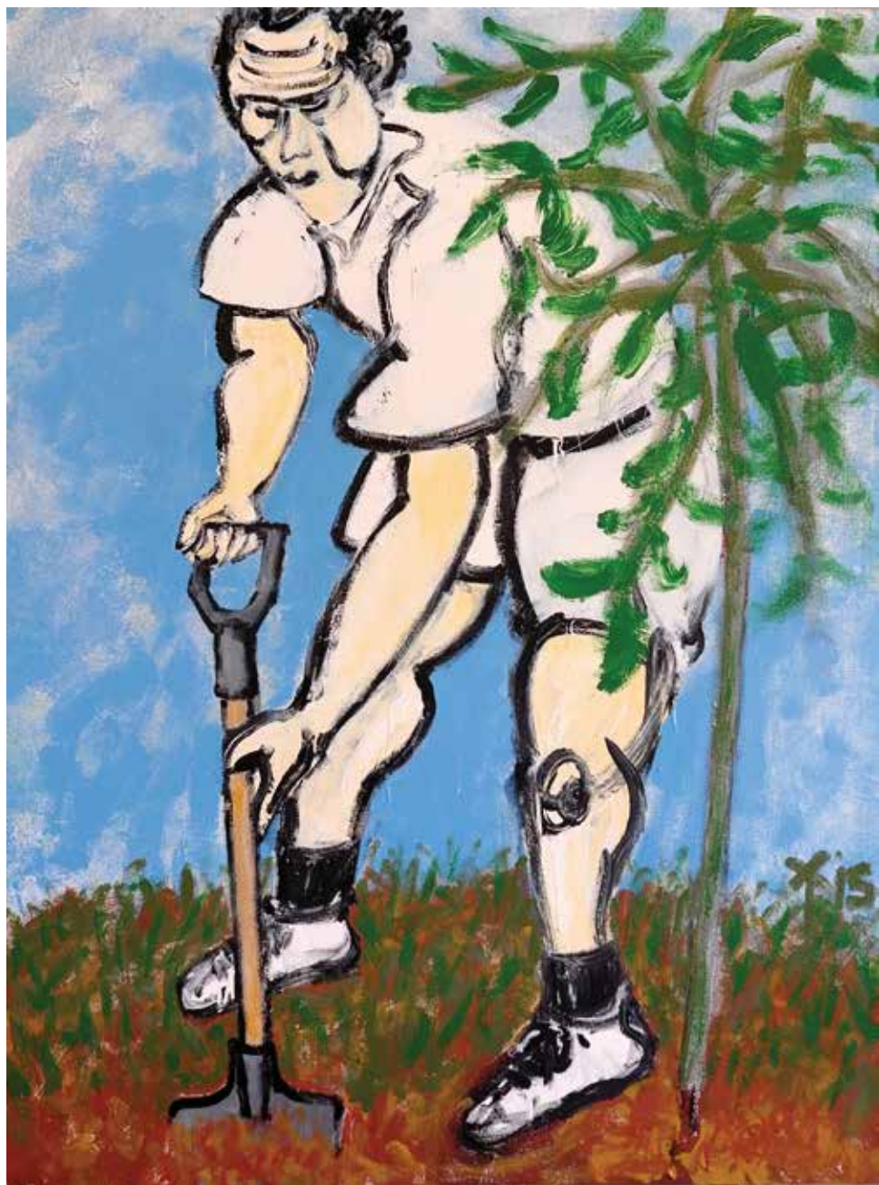
Architect of The Garden City (前人种树, 后人乘凉) - 2015