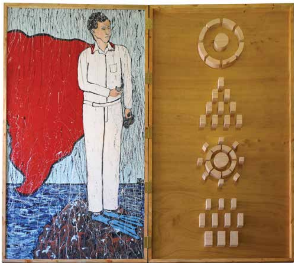
光宗耀祖 (Light and Brilliance) - 2014 / 2015