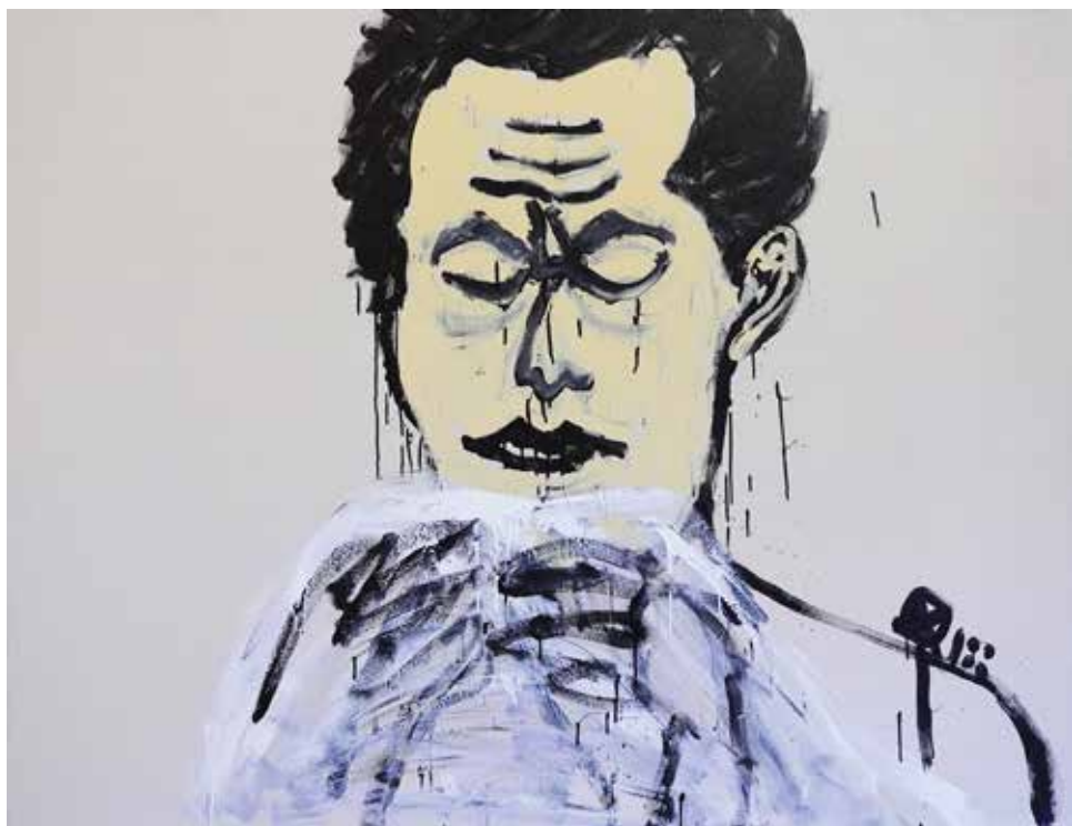
英雄有泪不轻弹 (A Hero Tears) - 2014