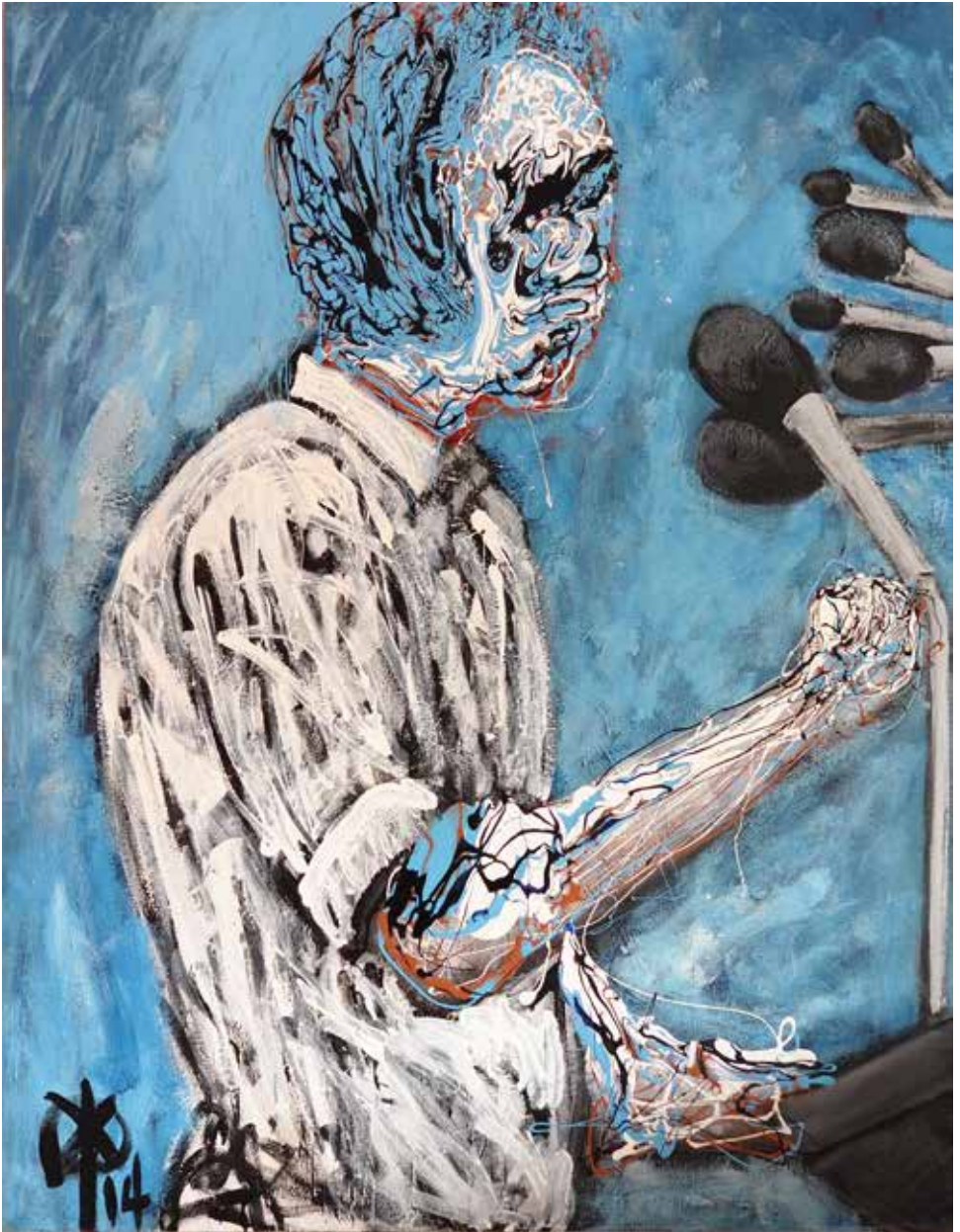
The Willing Spirit of a Worthy Leader - 2014