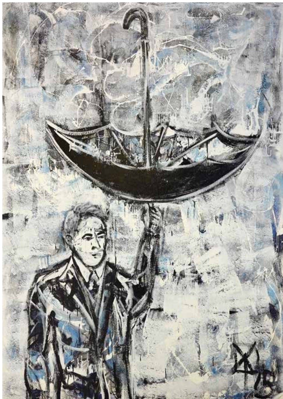
Every Drop Counts - 2015