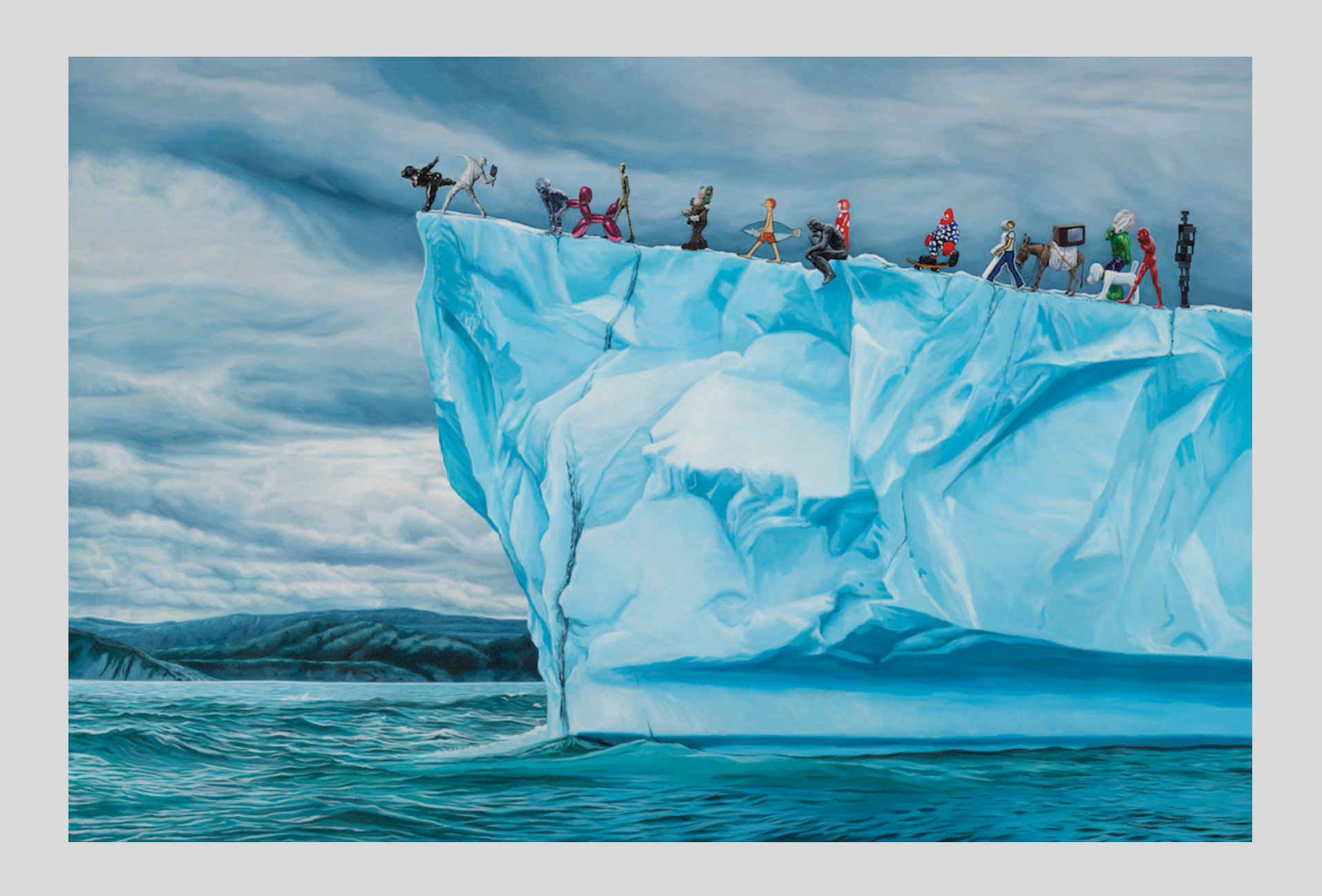
Ideal Life 180 x 120cm Acrylic on canvas