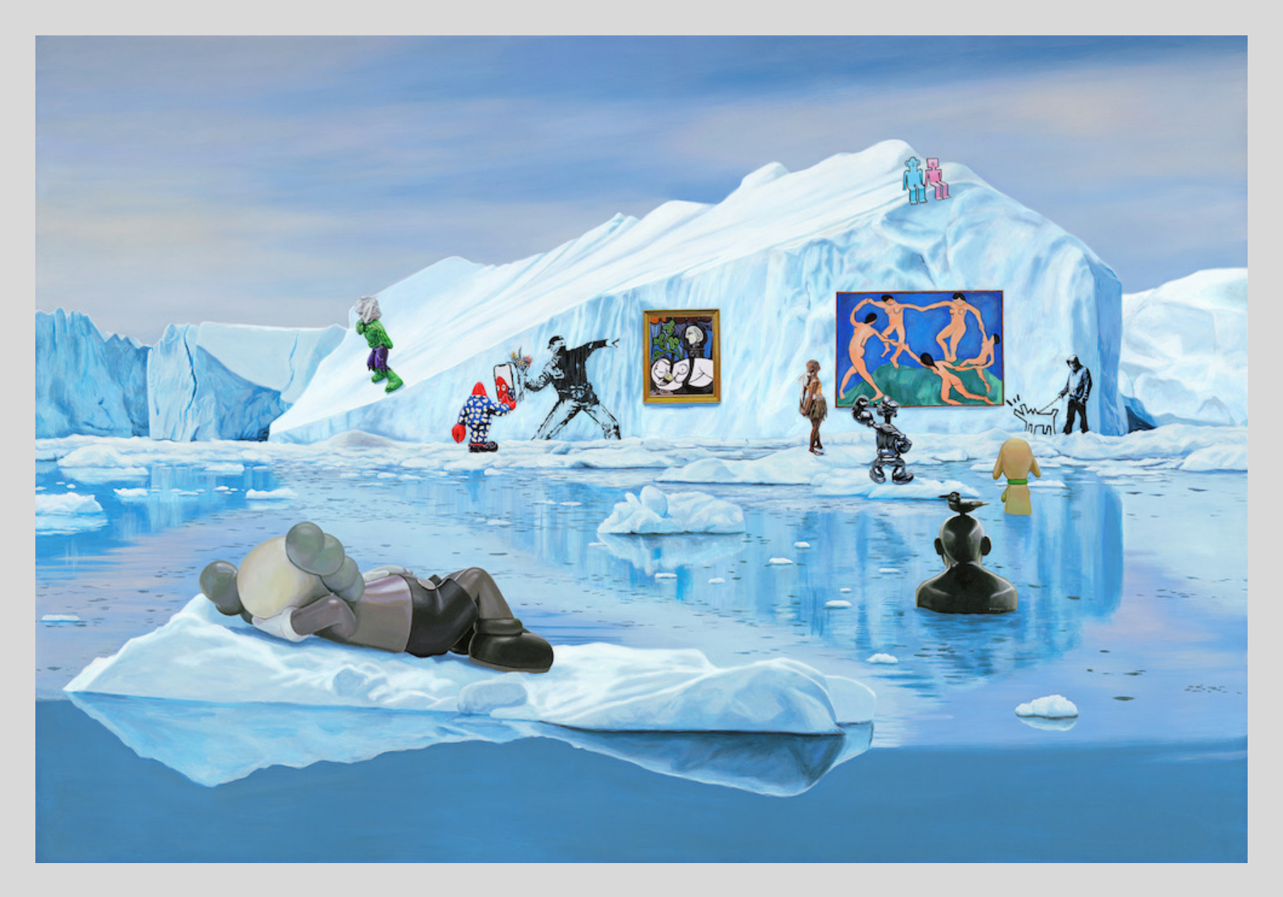
Art Museum on the Ice Mountain 110 x 160cm Acrylic on canvas