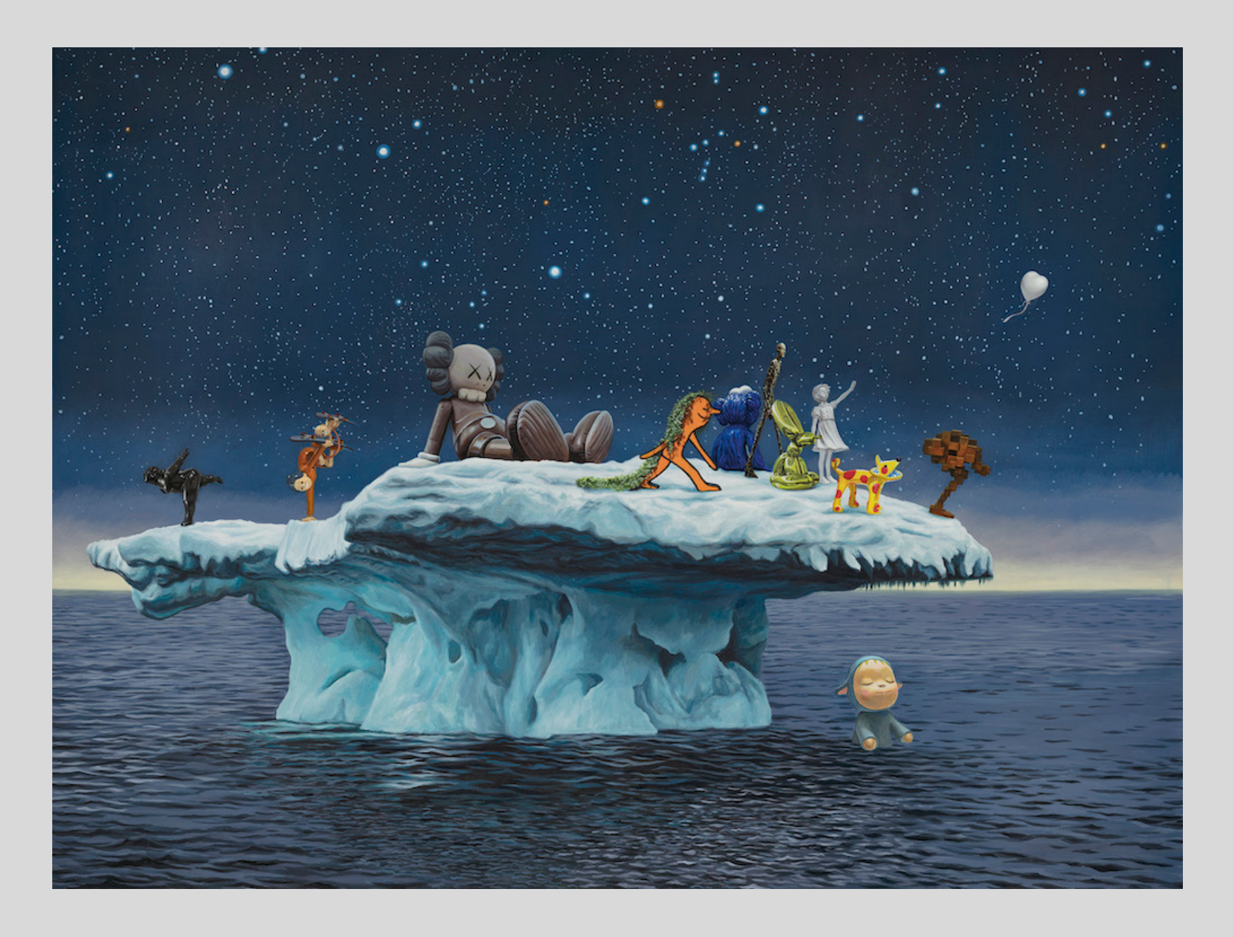
Starry Night 120 x 90cm Acrylic on canvas