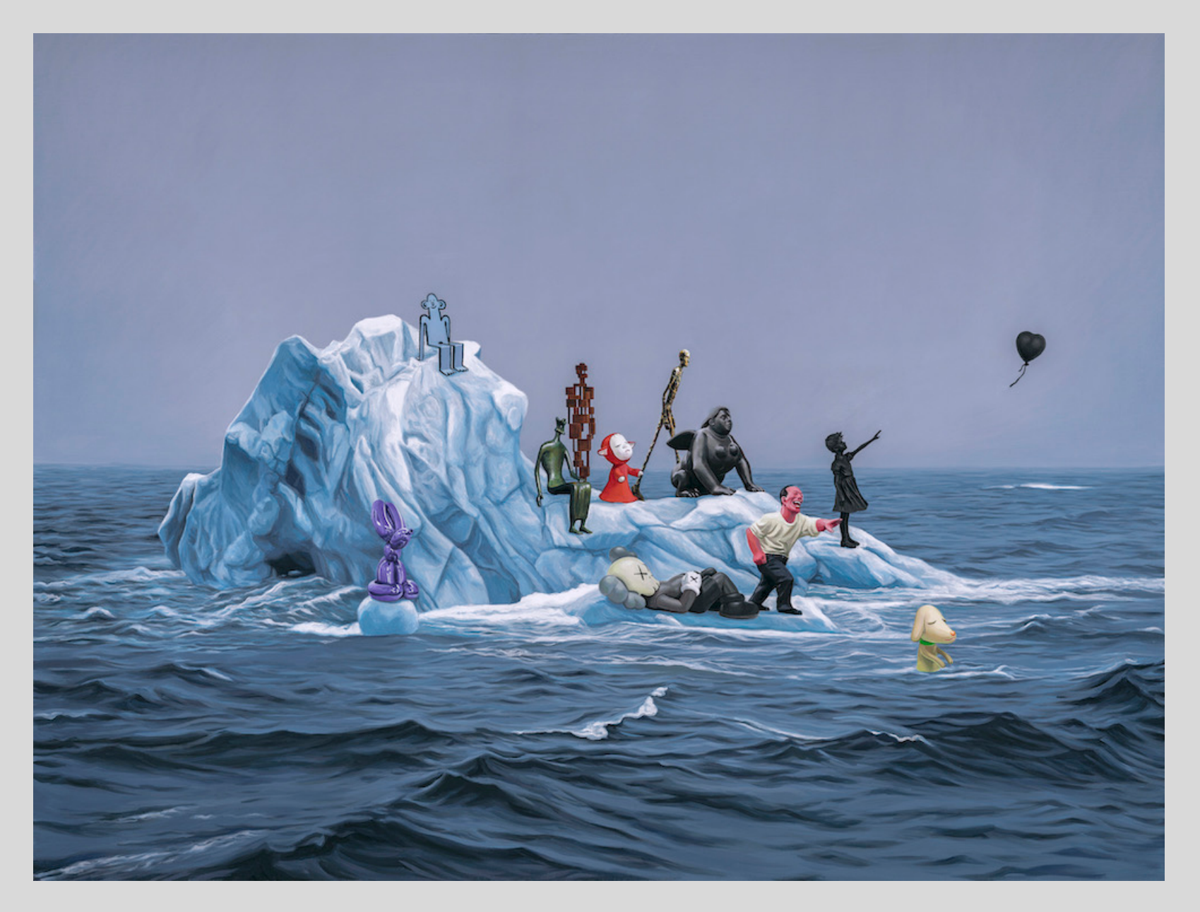
Visitors on the Ice Mountain no.10 120 x 90cm Acrylic on canvas