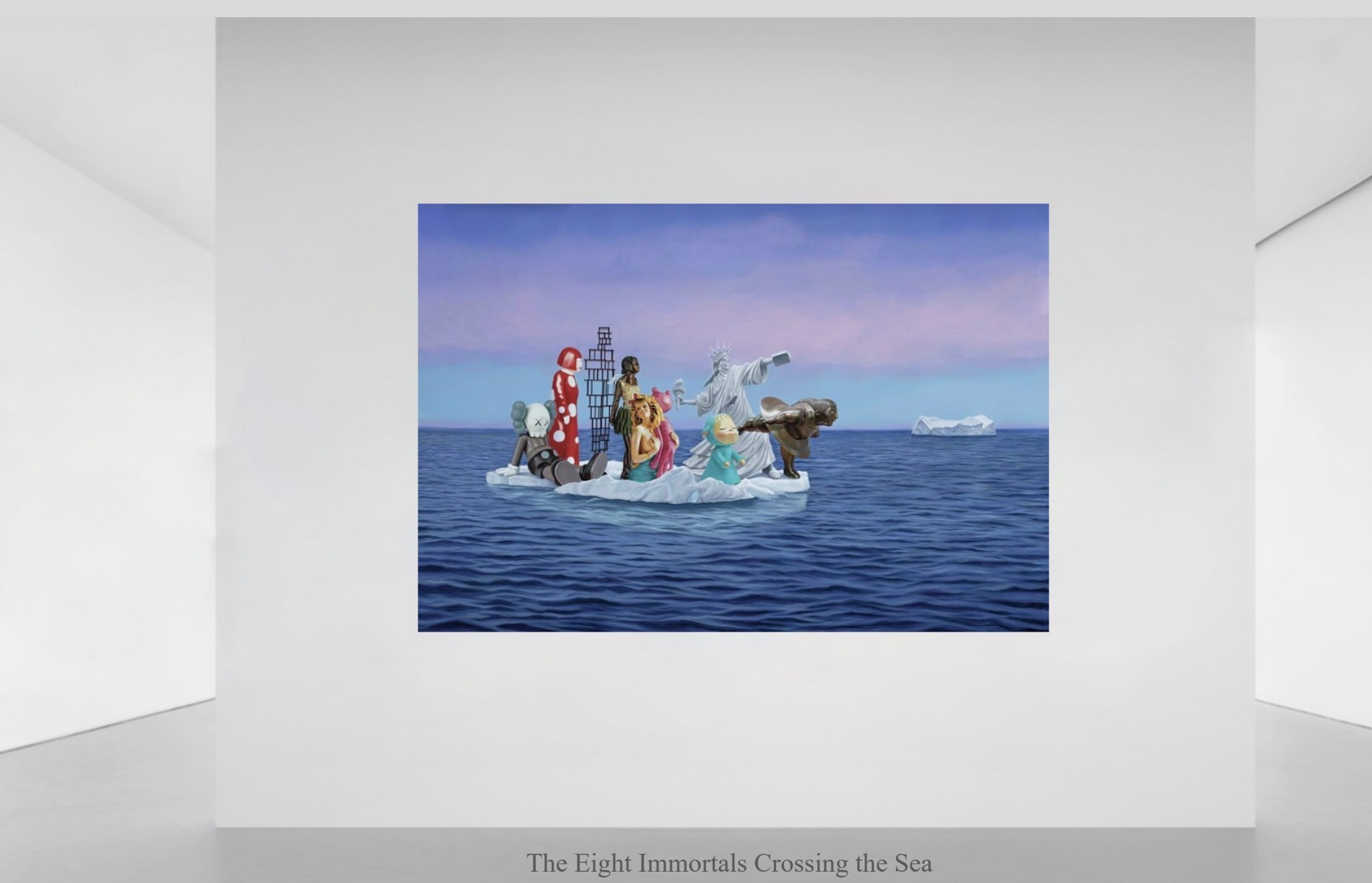
The Eight Immortals Crossing the Sea 110 x 160cm Acrylic on canvas