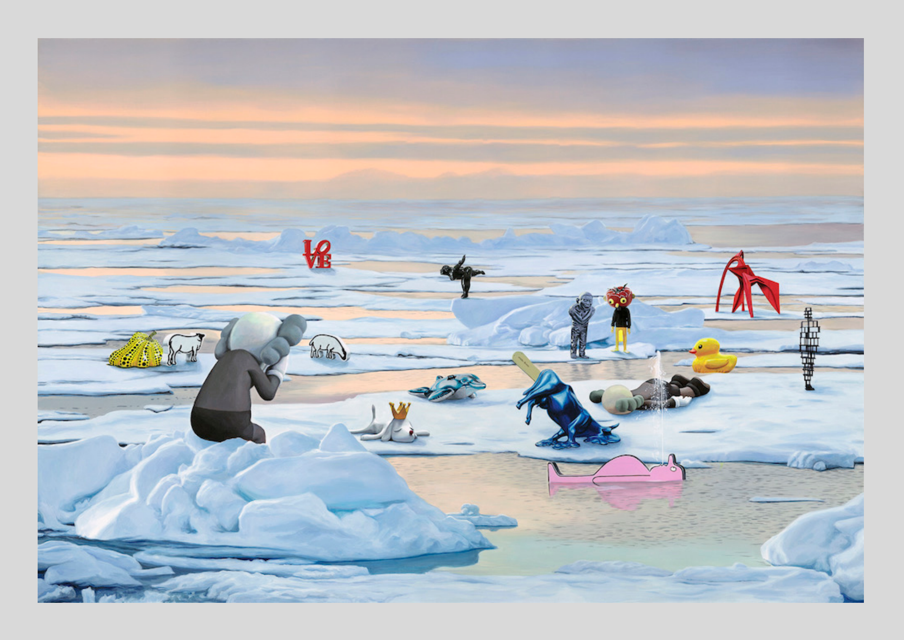
Spring Season is coming 110 x 160cm Acrylic on canvas