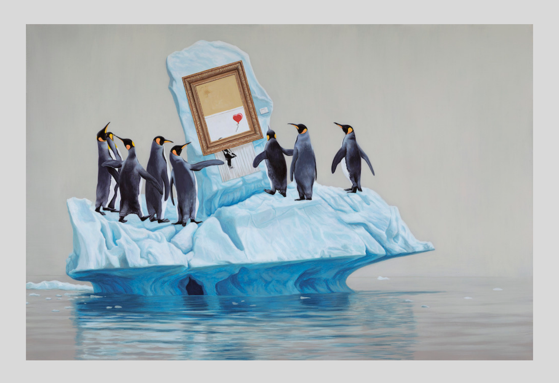
The Auction 120 x 80cm Acrylic on canvas