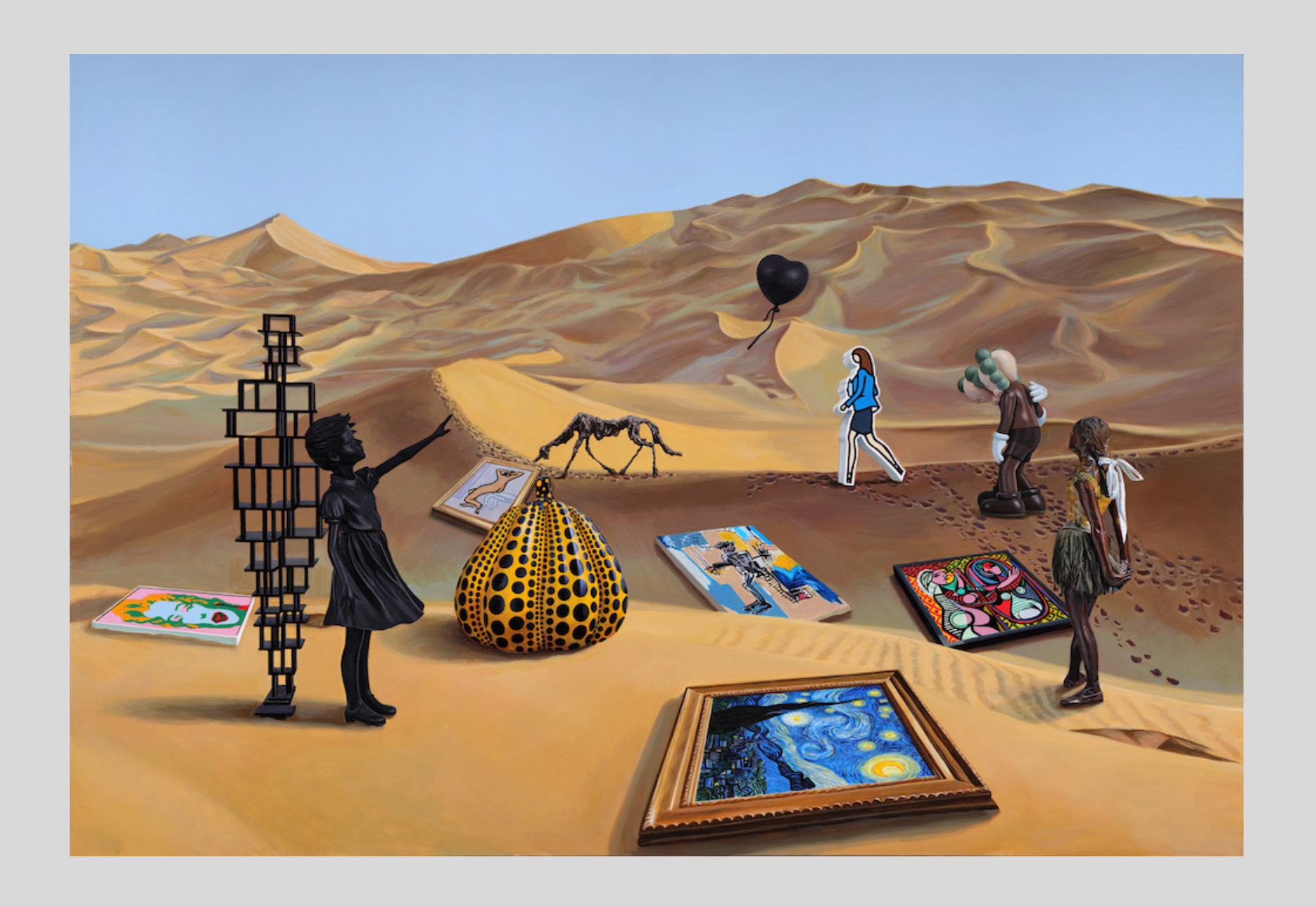
Art Desert 110 x 160cm Acrylic on canvas