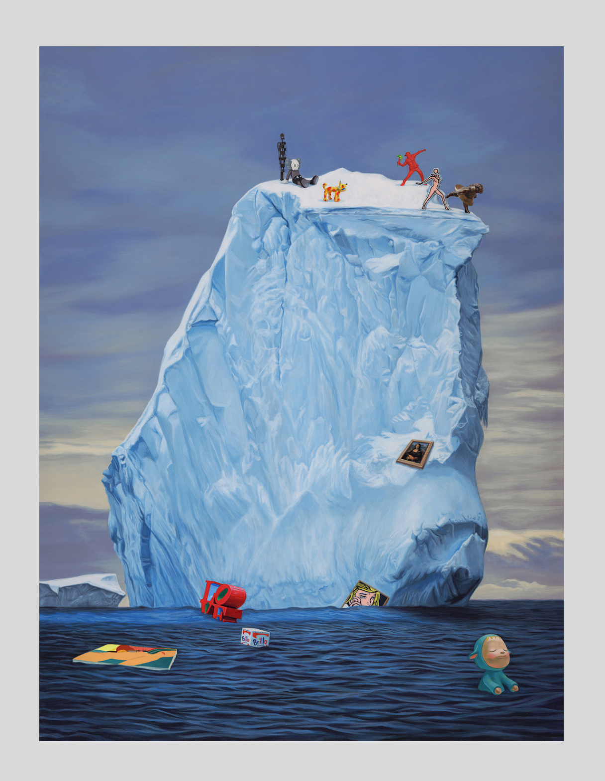
Climbing 120 x 80cm Acrylic on canvas