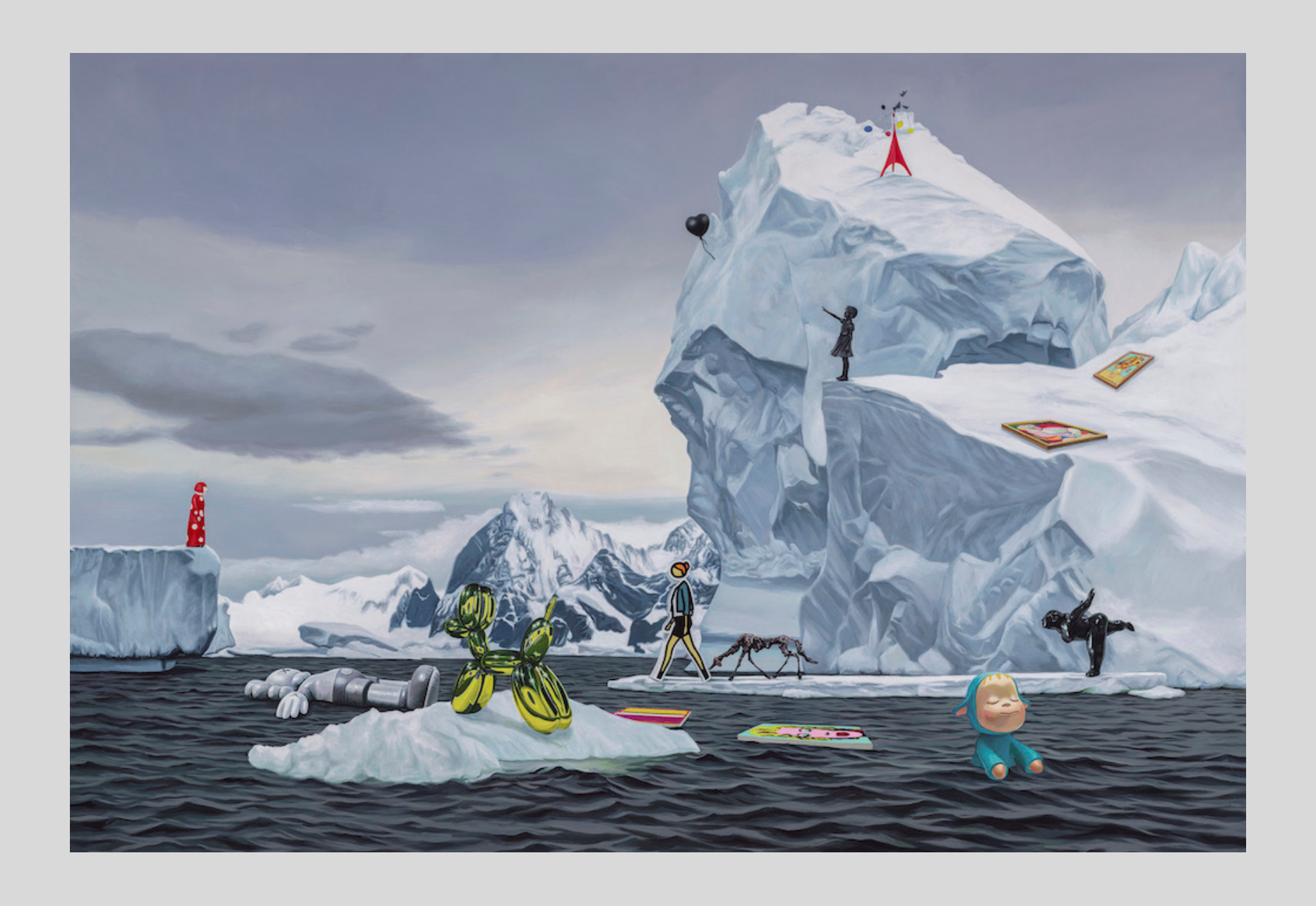
Visitors on the Ice Mountain no.1 110 x 160cm Acrylic on canvas